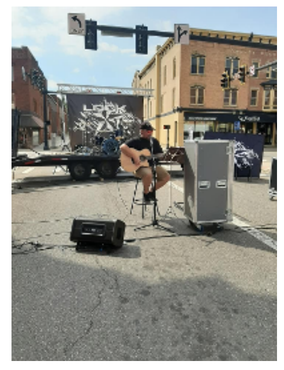
7,334 Facebook Likes 849 Instagram Followers