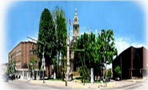
Downtown Cambridge, OH Historic District